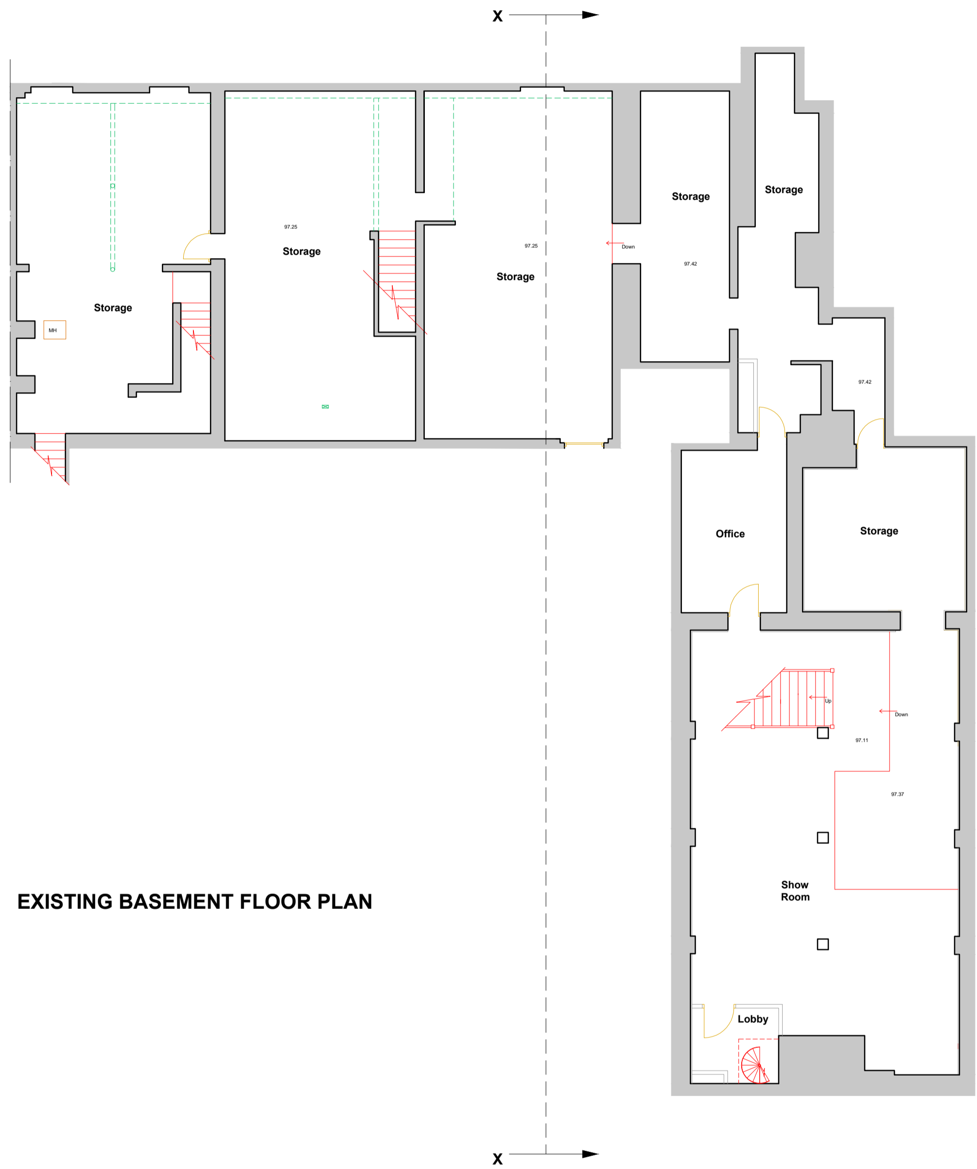
EXISTING BASEMENT FLOOR PLAN